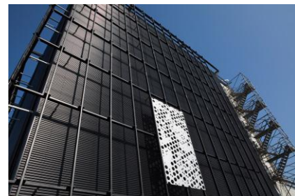
Les Archives Départementales du Nord à Lille.

The Archives of the North are the biggest center of archives after the National Archives in Pierrefitte-sur-Seine. This new construction, at the end of works, concerns essentially the storage areas and a few spaces of work but not the public spaces. (Architects: De Alzua & Zig-Zag. Cost: 33 million euro).