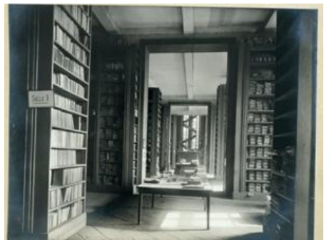
Formers archives building in two French departments : La Marne et le Puy-de-Dôme

Some buildings of the beginning of 20<sup>th</sup> century are still in service as in the departement of the Lot-et-Garonne. (Photos).