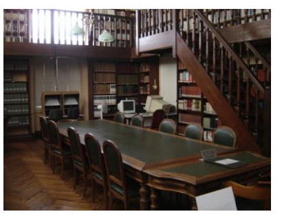
Archives départementales du Lot-et-Garonne (photos Ph. Henwood)